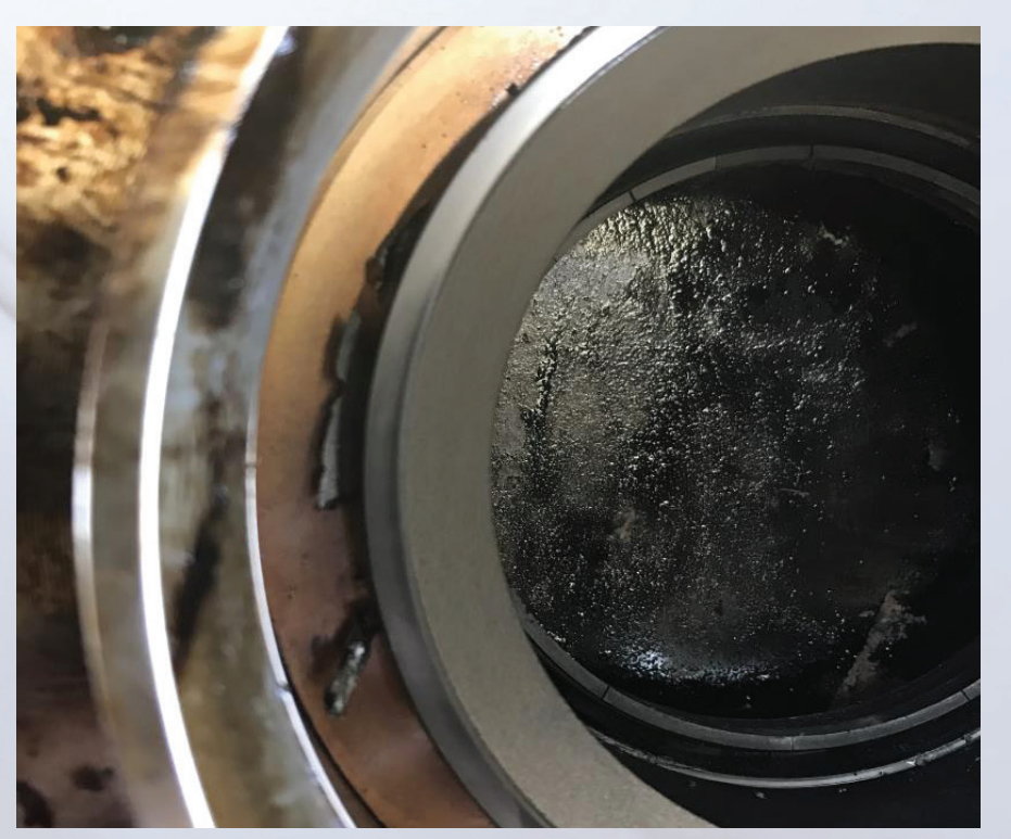
Despite phases without flushing, the DiamondFace sliding faces were still in top condition after 18 months.

All in all, one and a half years of field testing showed that robust single seals with DiamondFace withstood a supply with 70 % less flushing fluid and operated reliably in a very harsh environment. Minimizing the consumption of naphtha and reduction of cost are possible. If the customer equipped all 22 twin-screw pumps with DiamondFace seals from EagleBurgmann, he could save approximately 81 million US dollars every year.