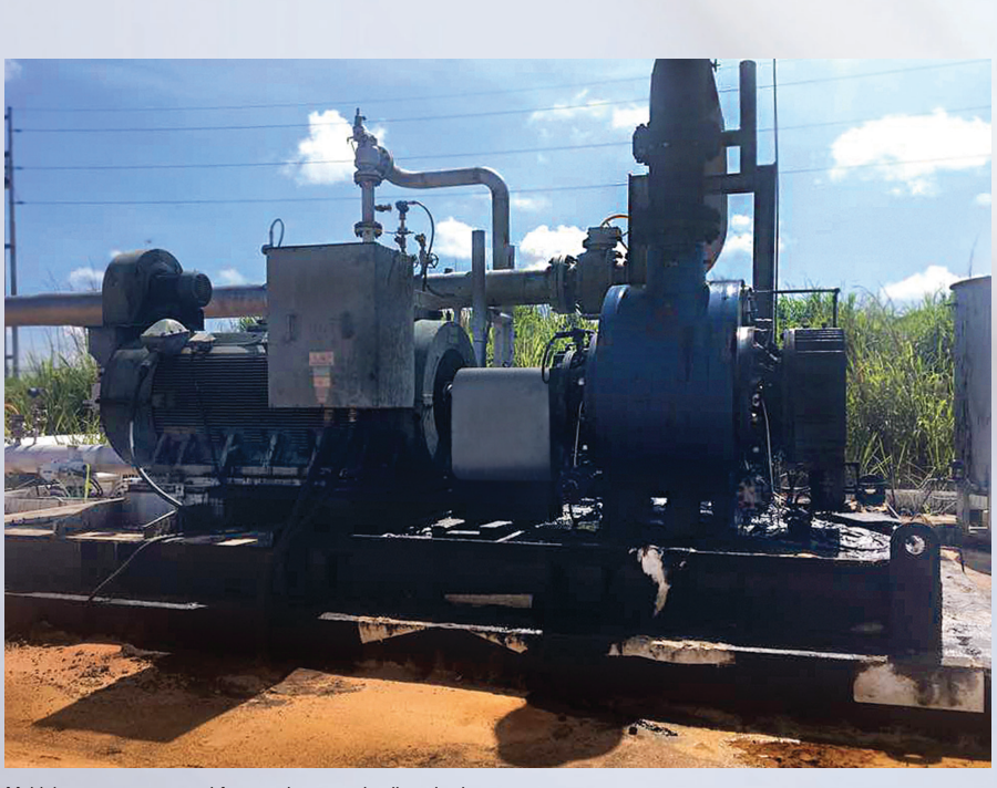
Multiphase pumps are used for extra-heavy crude oil production.

The customer also insisted on a single mechanical seal because a dual pressurized seal would require a maintenance-intensive barrier fluid system. Not only would the capital expenditure be high to retrofit or upgrade the existing pumps, the maintenance risk in the unmanned stations was prohibitive as well. This made suitable materials for the new sealing concept all the more important.