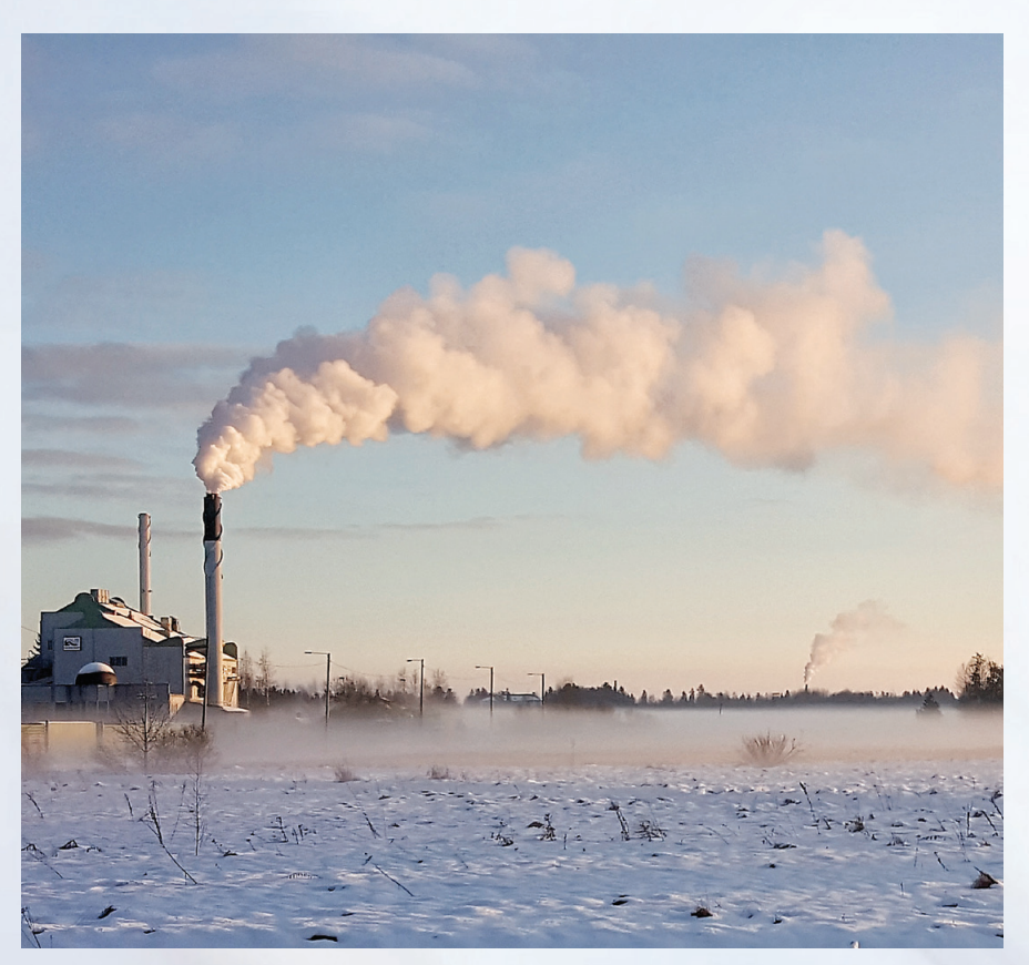
Since decades EagleBurgmann has brought an innovative approach to shaping the sealing technology in the demanding power industry

EagleBurgmann with the aim of collaborating closely to develop a permanently safe sealing solution.