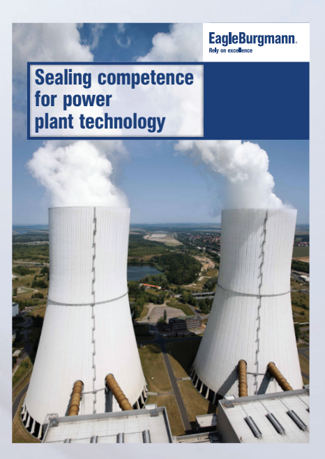
Further references can be found in our brochure "Sealing competence for power plant technology".