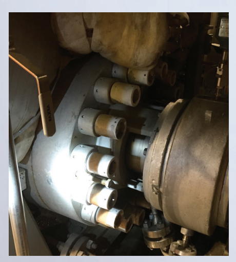
The pump before installation of the EagleBurgmann seal

A market player had initially equipped the pump with mechanical seals. But they failed unexpectedly regularly within three to six months after commissioning. This resulted in several dangerous steam leaks. Luckily the plant personnel were not injured, but the seal failures incurred immense costs. The power plant operator then commissioned a different pump manufacturer to offer a new pump. But it was determined that the use of a new pump was not feasible for design reasons. And so this renowned manufacturer approached